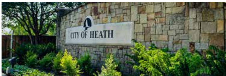
PROJECT 3: Repair and beautification of Heath entry monument