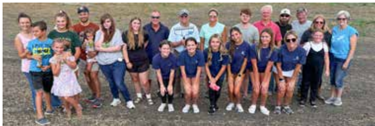
PROJECT 4: SOW Heath - a pilot planting of Texas native bluebonnet seeds on City-owned land at Heathland Crossing and FM 549.