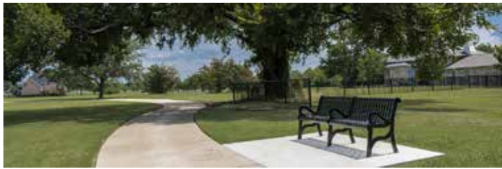
PROJECT 1: 25 Mature shade trees/5 new park bench pads/dog & people fountain installed in Towne Center Park

Successful PATH projects made possible by Charter Members and Donors include: