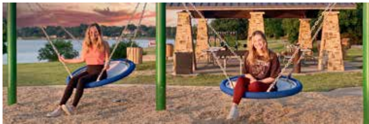
PROJECT 2: Sunset Swings at Terry Park – replacing old equipment with new swings for all ages/abilities