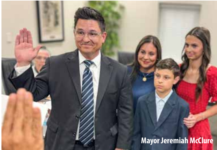
Mayor Jeremiah McClure