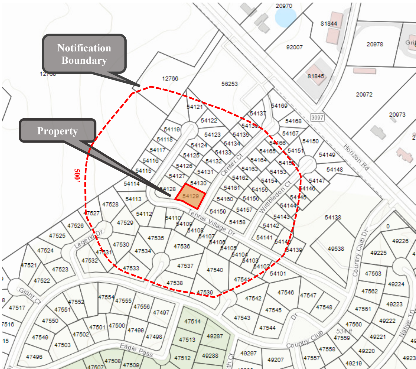
Vicinity Map (Not to scale)