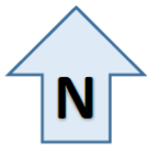
Vicinity Map (Not to scale)